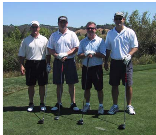
Foursome Team from Citibank