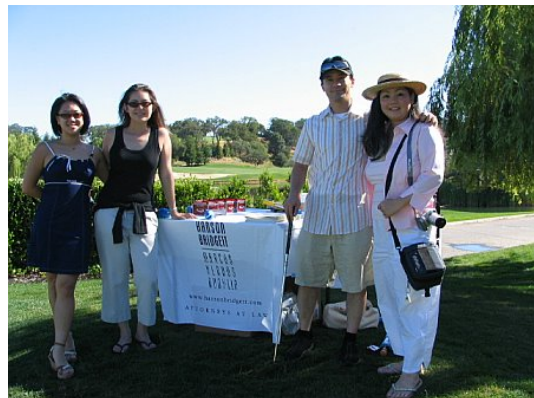
Event Sponsor Hanson Bridgett at the Putting Contest